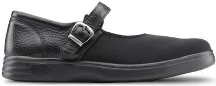
Black Lycra** 4415