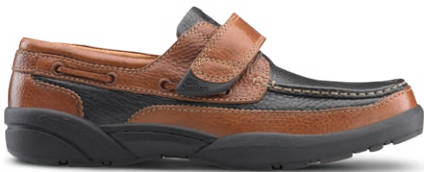
Black/Brown Multi 8660