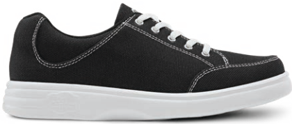
Midnight (black/white) 0250