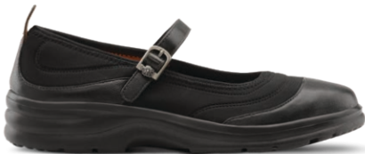
Black Lycra®* 2315

Style: Mary Jane Upper: Leather Interior: Leather Outsole: EVA Closure: Hook-and-loop Sizes: M, W (4-11, 12), XW (4-11)