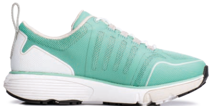
Seafoam Green 10325